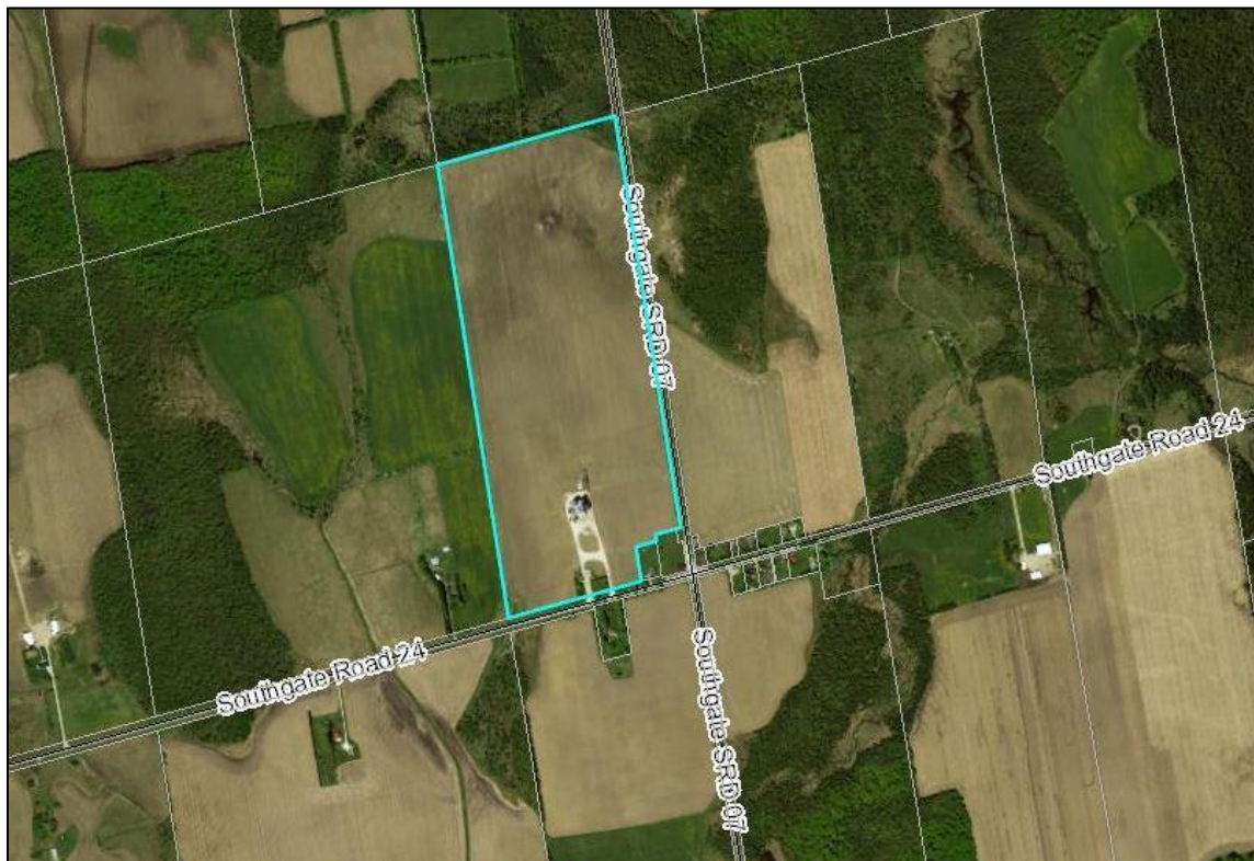
Map 1: Airphoto of the Subject Property and Surrounding Lands

The subject lands are located on the northwest edge of Swinton Park, with access off of Southgate Sideroad 24, while also bordering on Southgate Sideroad 7. Currently the majority of the subject lands are farmed, with the grain elevator, drying, and storage business occupying a relatively small portion of the farm parcel. The proposed amendment would contemplate severing the business from the remainder of the farm parcel, while also allowing for the expansion, and future further expansion, of the operation. Currently there are existing silos on-site that total approximately 689 m 2 in area. The proposed expansion would contemplate a further 1,538 m 2 , while also allowing for an additional access off of Southgate Sideroad 7. An airphoto showing the subject lands and surrounding properties has been included as Map 1, while the proposed site plan is Map 2 below.