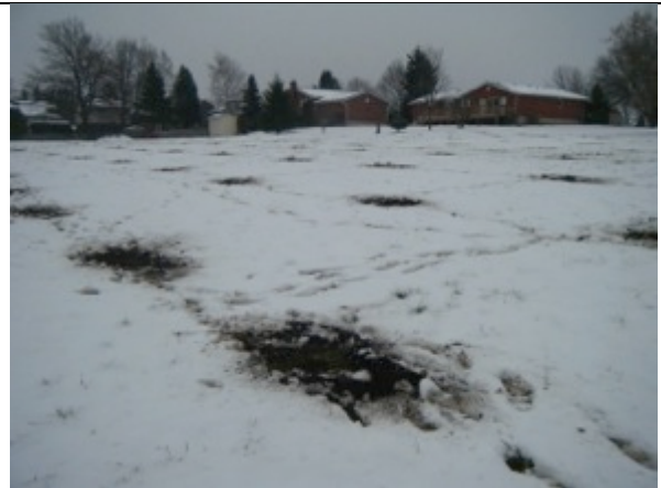
PLATE 8 TEST PIT IN PROGRESS, EASILY EXCAVATED