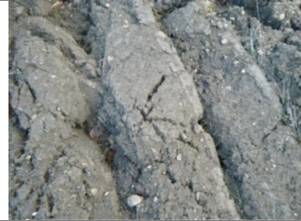
PLATE 10 PEDESTRIAN SURVEY GROUND CONDITIONS