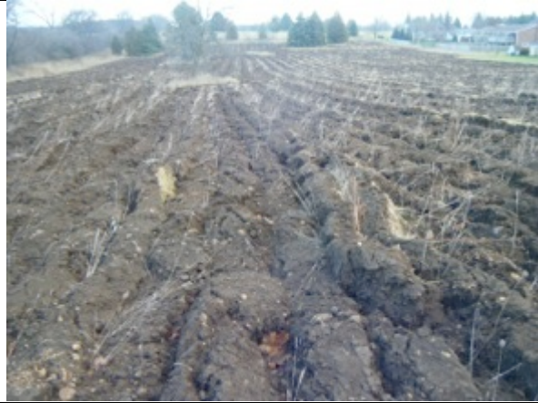
PLATE 9 PEDESTRIAN SURVEY FIELD CONDITIONS