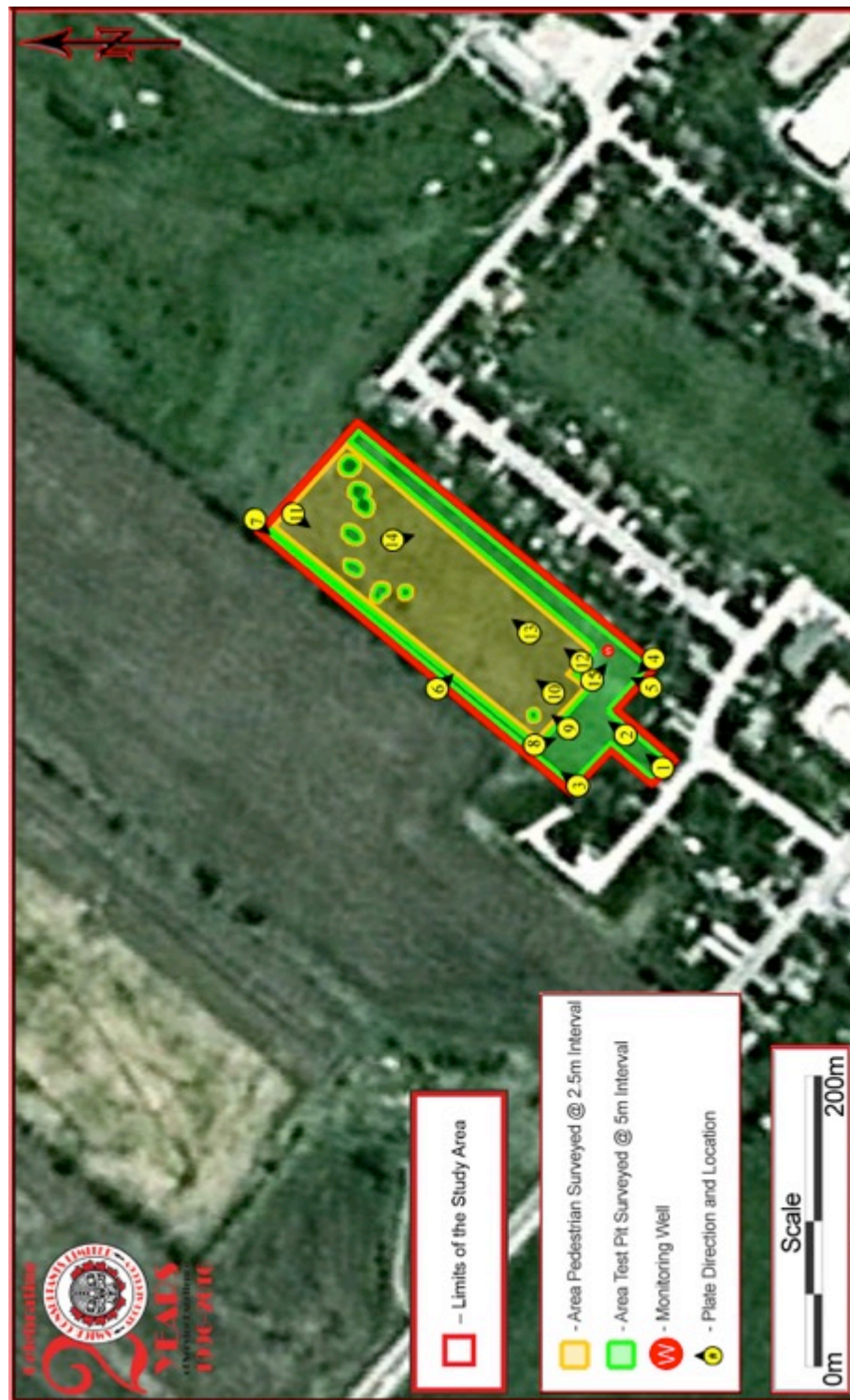
FIGURE 4 AERIAL PHOTO OF THE STUDY AREA