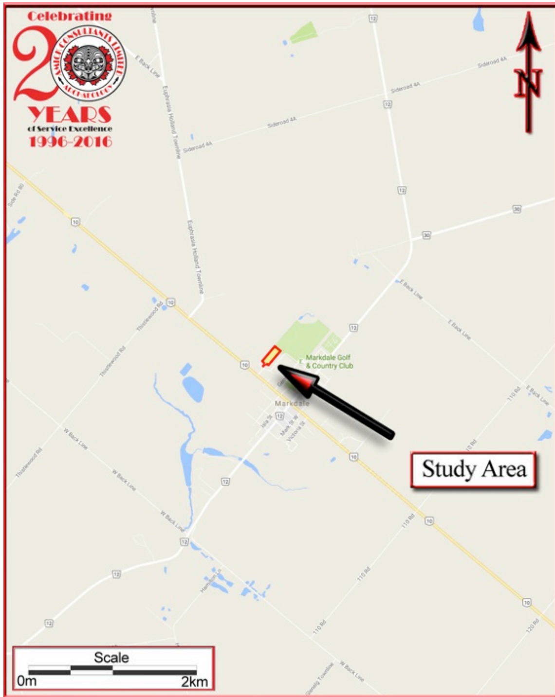
FIGURE 1 LOCATION OF THE STUDY AREA (GOOGLE MAPS 2012)