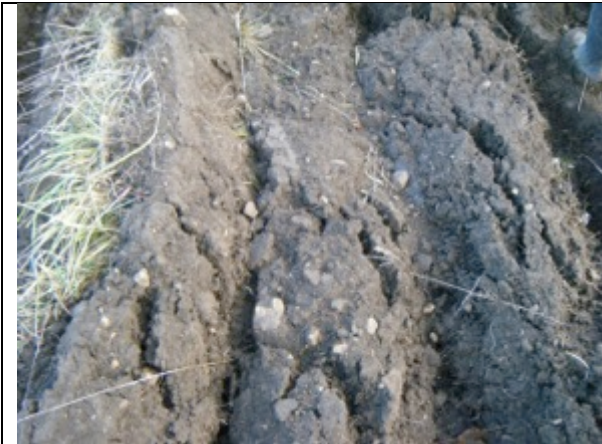
PLATE 13 PEDESTRIAN SURVEY GROUND CONDITIONS