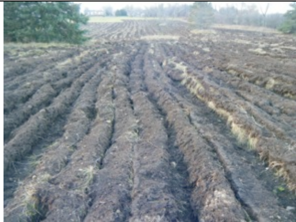
PLATE 11 PEDESTRIAN SURVEY FIELD CONDITIONS