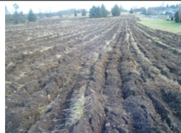
PLATE 12 PEDESTRIAN SURVEY FIELD CONDITIONS