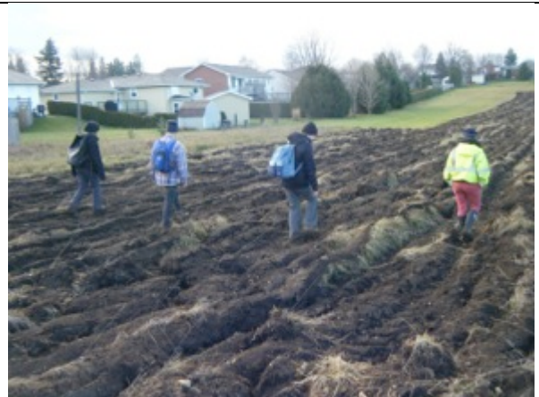
PLATE 14 CREW @ WORK