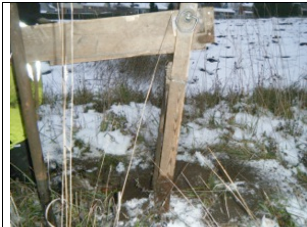
PLATE 7 TEST PIT IN PROGRESS, EASILY EXCAVATED