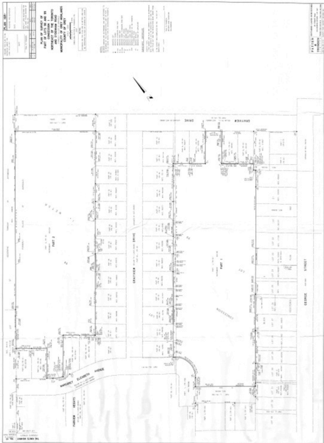
FIGURE 3 PLAN OF SURVEY (GREY COUNTY, 2016)