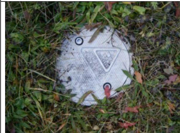
PLATE 15 MONITORING WELL