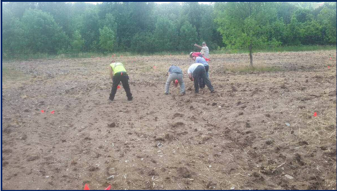
Photo 2: Surface Visibility during the CSP at P2 (BdHb-7), Facing Southwest