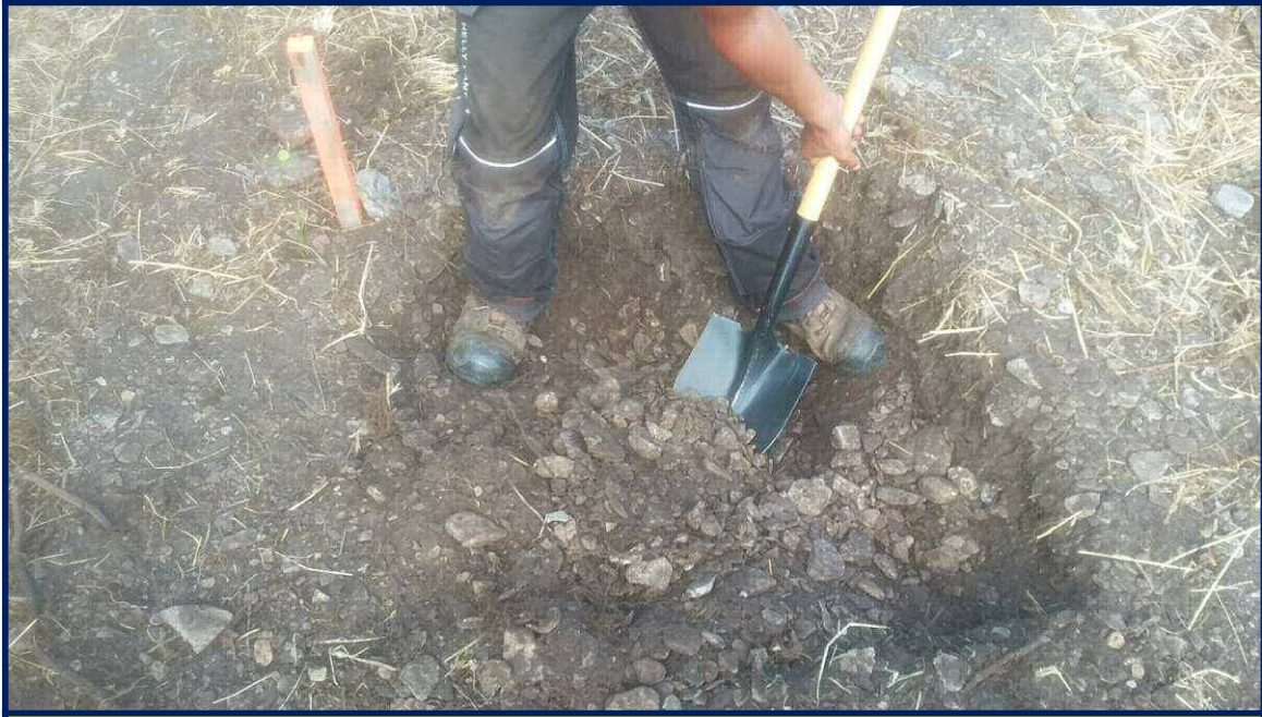
Photo 6: 550E 1000N:1 Typical Test Unit at P2 (BdHb-7), Facing North